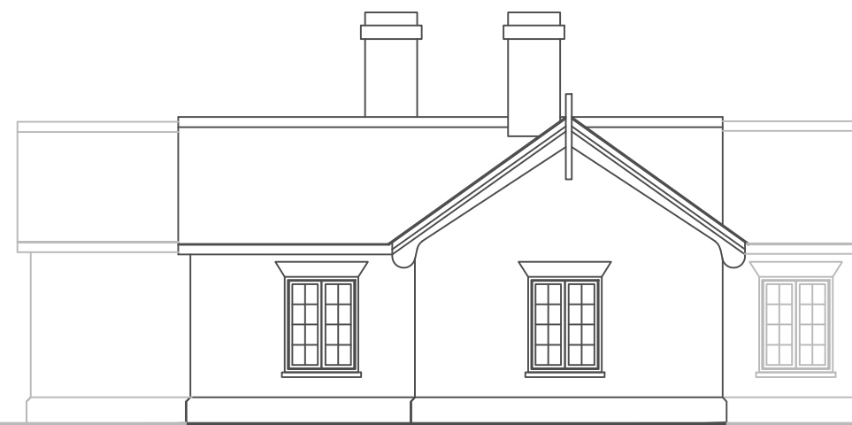
Existing House Side Elevation Scale 1:100

project Wedgewood Park Corner, Groton Suffolk, CO10 5EG